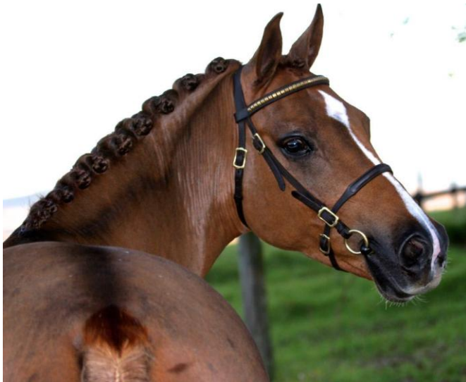
Highover Jack Sprat