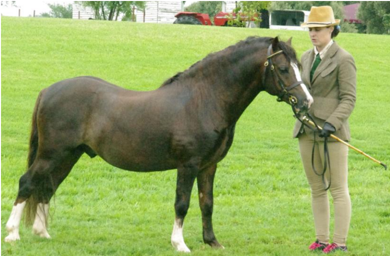
Tipuana Flamboyant

As he has done for the last few years, Tipuana Stud’s Tipuana Flamboyant went forward as the Supreme Champion of his section to represent the Section As in the Supreme Interbreed competition held on the last day of the show.