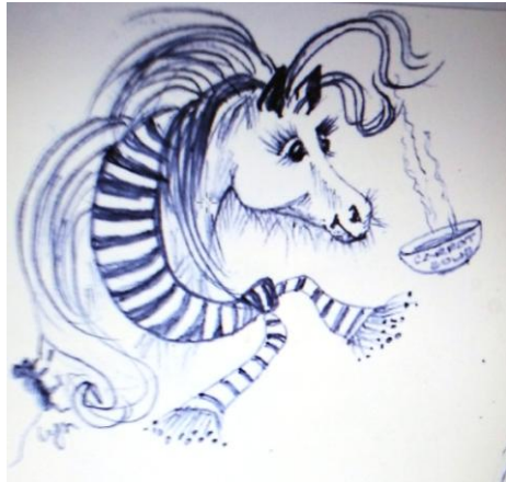
Original drawing by Lyn King