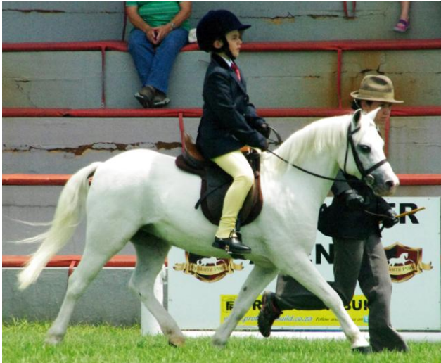
Tipuana Welsh Wizard