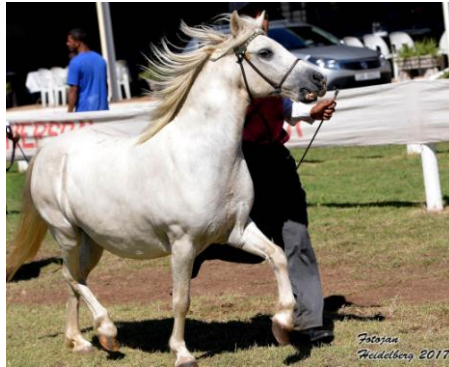
Llandilo Fleur de Lis