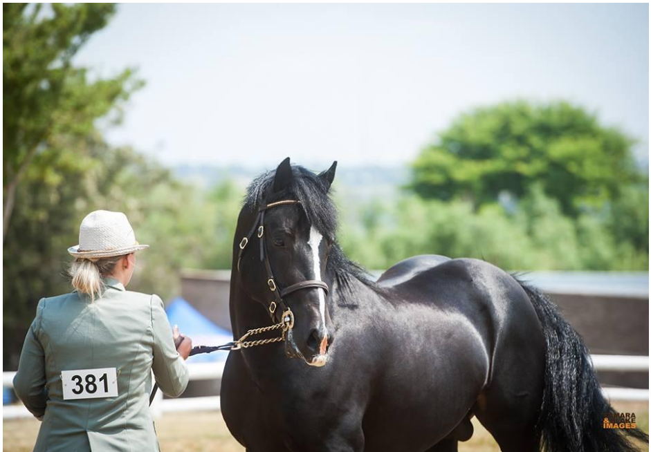
Llandilo Pentagon (Horse of the Year 2016)

Please visit our website www.bendithio.co.za , as well as our facebook page Bendithio Welsh Ponies and Part-Breds for more info