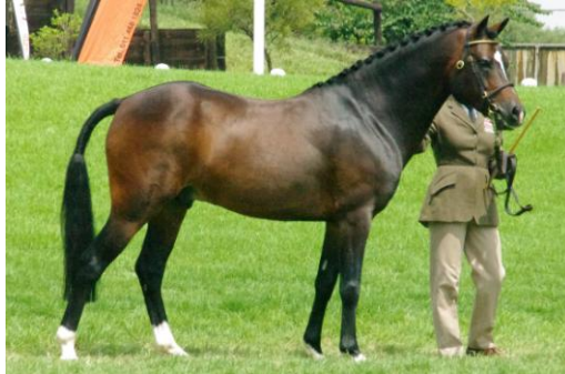
Waterside Solitaire