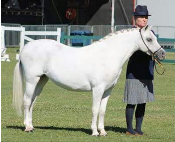
Pemandus Princess of Narnia