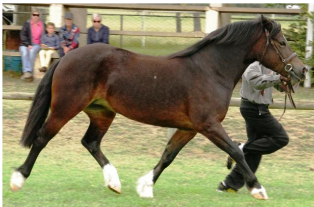
Freyja Fflam Goch