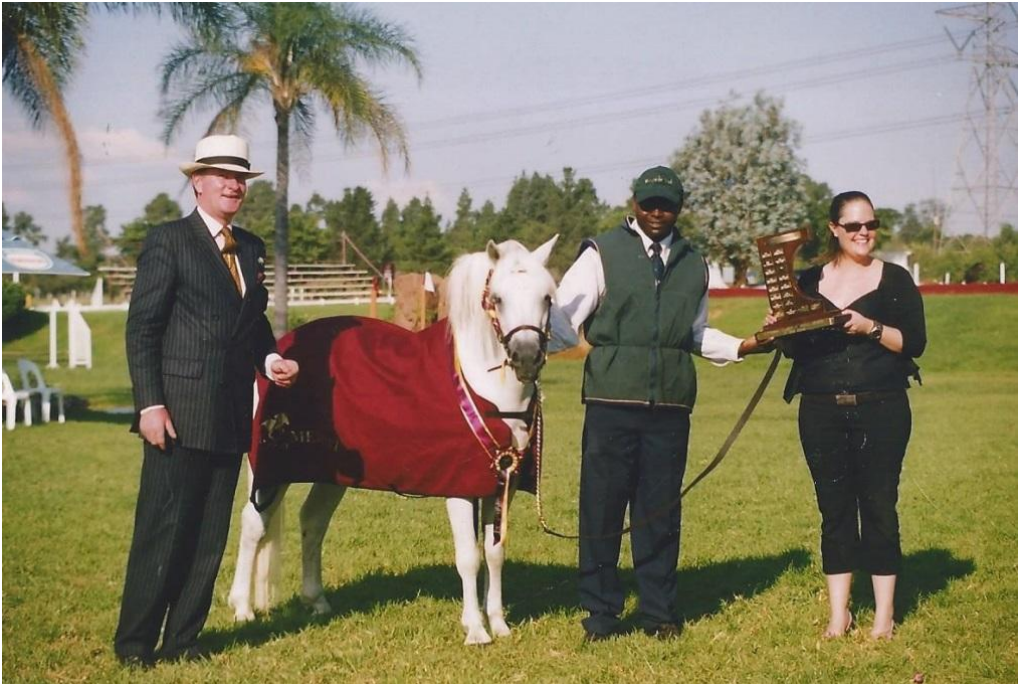
Horse of the Year Supreme Champion Breed Horse

Foresyte Bannut Glyndwr was one of South Africa's most successful Welsh stallions and he will be deeply missed.