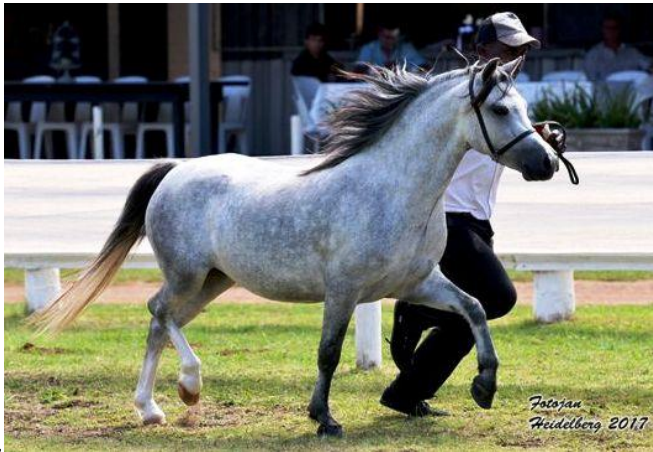
Paddock Hill Sun Carousel

For a visitor from the Northern Region it is always a treat to officiate at a true agricultural show of the type we no longer see in Gauteng and the efficient organization and friendly atmosphere at Heidelberg was exceptional. In addition to the cattle sheep and Youth Show there were several breeds of horses and ponies on show but by far the largest entry was from the Welsh Ponies with almost 100 ponies entered. Several ponies stood out in the very strong Breed classes. The day started with a very smart foal Pajayhu Snow Boy, bred by Paul Carstens. This was followed by some really good Junior classes, with Dunhaven Demonstrator, bred by Adam Majiet winning the 2- 4 colt class. The Junior mare was Paddock Hill Sun Carousel bred by Prof. Adrienne Van Blerk. In addition to being pretty and feminine this pony moves well and if there had been a Reserve Supreme Champion she would definitely have been in contention.