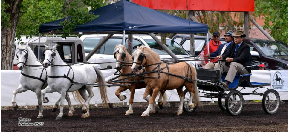
Hansu Stud winners of the team of Four Championship.