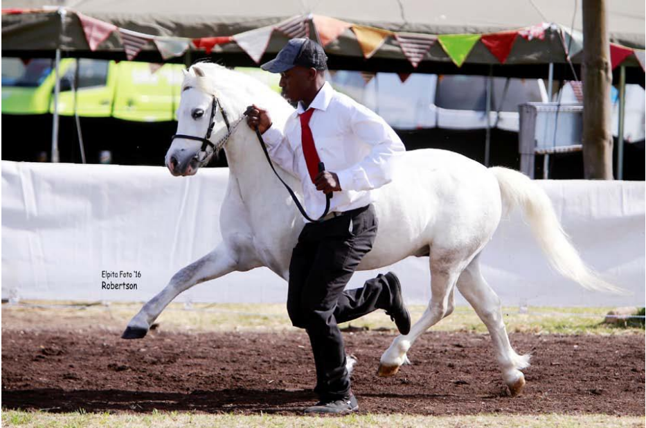
PADDOCK HILL SUN GLITTER, OUR STUD STALLION

To the very great credit also of Sundew must also go the string of successes which her other Paddock Hill daughters, Paddock Hill Sun Frolic, Sun Kissed, and Sun Splash have achieved over our eight years of showing both at National and Regional levels. Her son, is the beautiful Paddock Hill Sun Glitter, who is proving to be a very successful breeding and showing stallion; in the latter regard having qualified for the Supreme Championships in all his National and Regional outings, on each occasion also under overseas judges.