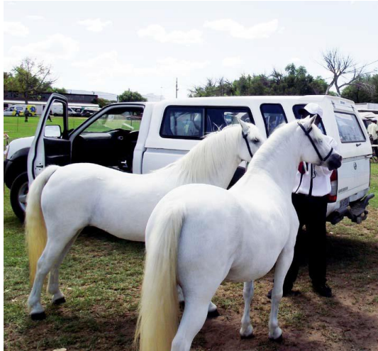
LLANDILO SUNDEW TAKING RESERVE SEC A SENIOR MARE TO HER DAUGHTER, SUN COQUETTE

Mention cannot be made of the success of Sun Coquette – or indeed of the Paddock Hill “Sun” line – without saluting our dapper little broodmare, Llandilo Sundew. We acquired Sundew from Llandilo Stud. She was in foal - with Sun Coquette - to Llandilo Victor Ludorum (Bukkenburg Valerie x Nerwyn Llewellyn, imported by Llandilo Stud). Sundew herself is the last foal of Torbry Sungleam, who in turn was the product of a father on daughter mating of the imported stallion, Twyford Jock. The latter double mating has accordingly intensified the influence of this very successful showing and breeding stallion in our Stud. Through Sundew’s sire, Llandilo VIP, grandson of Revel Velveteen, we also have strong lines to Revel Velveteen’s best showing and breeding offspring with Coed Coch Nergog, for example the well known full sisters and brother, Bukkenburg Valerie and Vesta and Bukkenburg Vintage. Sundew’s own progeny are the products of four different sires which highlights the importance of good dam lines. In 2015, we showed Sundew at Nationals. We were thrilled when she was placed Reserve Senior Mare Sec A Champion to her daughter, Sun Coquette.