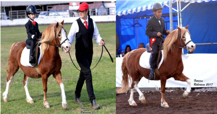
Marco Miss Robinson