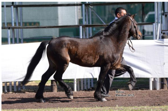
Ben-Hur JTM Supreme Champion Sec. B