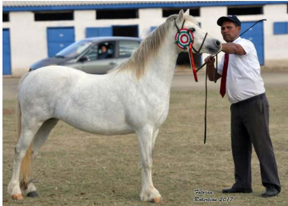
Pajayhu Snow Lilly (Pajayhu Vic's Boy x Llandilo Snow Crystal)