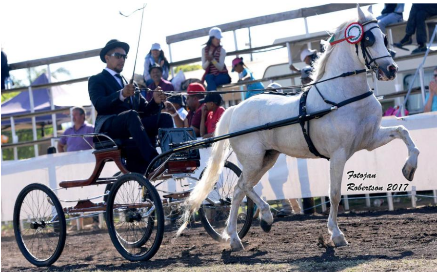
Koosbad Lady Pratco

The exciting Supreme Championship took place at prime time on Saturday afternoon and featured the top five from the stallions and mares under five classes and the top five from the Senior Stallion and Senior Mare classes. It was a tremendous competition with huge crowd support but one pony stood out as the unanimous choice of all three judges.