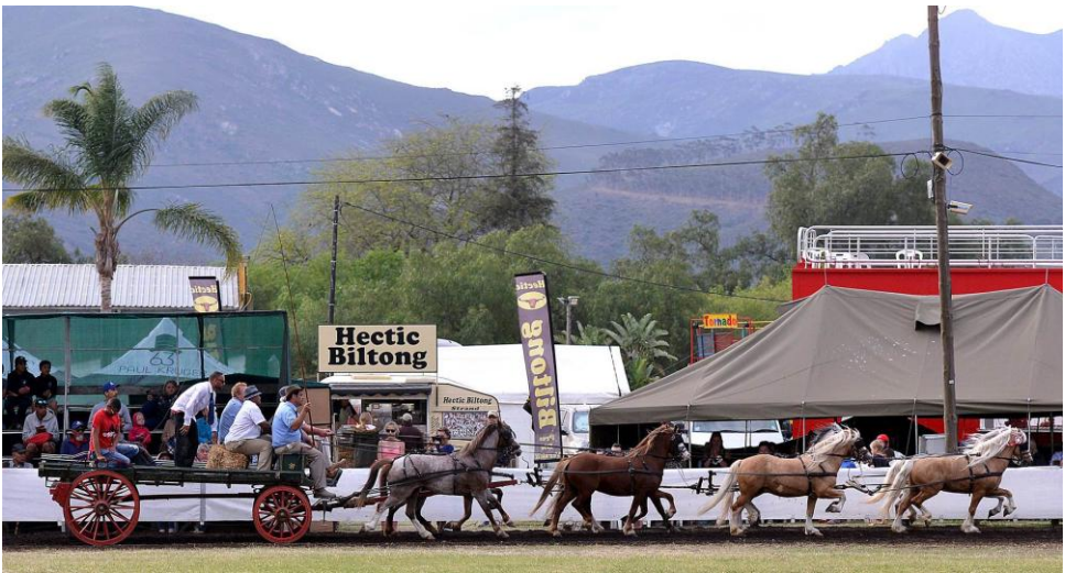
Hansu Stud team of eight